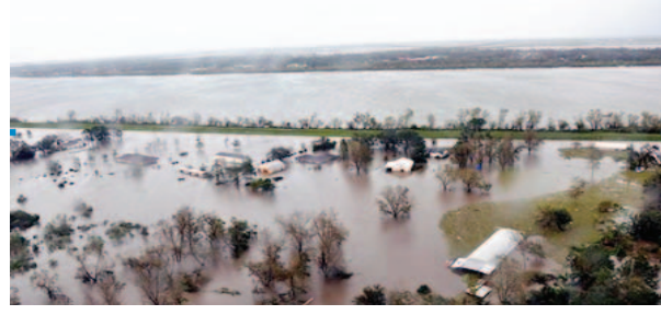
Figure 2: Flooding in Plaquemine Parish, Louisiana, following Hurricane Isaac. •The Gulf and Atlantic coast

We assembled historical records of rainfall, tide gauge readings, and hurricane tracks to see how often compound floods have occurred at 30 sites around the US coast. The length of the record differs for each site, but two-thirds have a record at least 65 years long. It is found that the number of compound events has increased for many sites, including major cities such as Boston, New York City, Tampa, Houston, San Diego, Los Angeles, and San Francisco. These changes in the risk of compound flooding are likely to be exacerbated by ongoing sea level rise, which has been identified in other studies as the main driver for changing coastal flood risk.