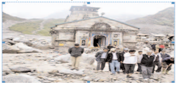
Figure 3: Disastrous Flooding at Kedarnath Temple

The Kedarnath valley, along with other parts of the state of Uttarakhand, was hit with unprecedented flash floods on 16 and 17 June 2013. On 16 June, at about 7:30 p.m. a landslide and mudslides occurred near Kedarnath Temple with loud peals of thunder. Prof. Singh was the only Scientist who declared it is not cloud burst but it happened due to hair crack into the thick glacier sheets on account of global warming at high altitude of Himalayan. The heavy glacier sheets gone down during first rain and created havoc. Such landslides and mudslides frequency will increase in future every year all over the Himalayan with more intensity and will disrupt the life of this region.