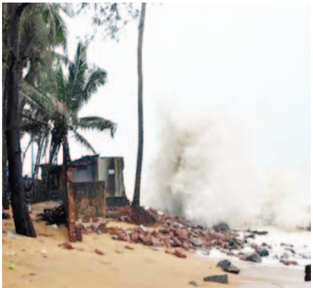
Figure 5: Cyclonic Storm Fan

storm has since weakened but will remain a dangerous system as it moves up India's east coast toward Bangladesh, where 2.1 million people were evacuated,. Flash flooding and potentially deadly landslides may occur. Overall, the United Nations warns that 28 million people live in the path of the storm.