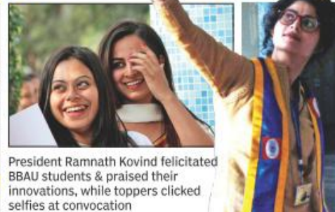
President Ramnath Kovind felicitated BBAU students & praised their innovations, while toppers clicked selfies at convocation