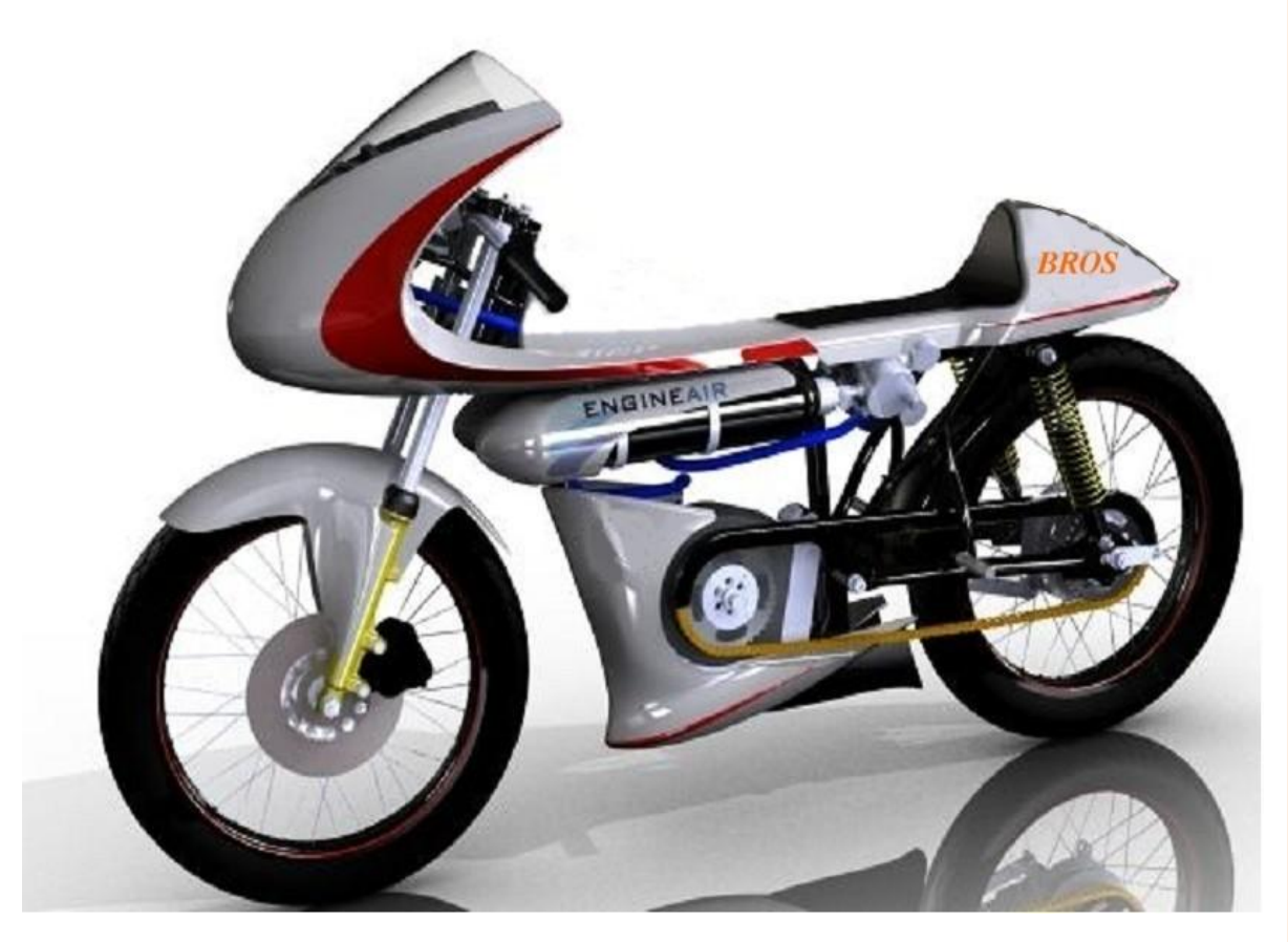
Fig. 1: Computerized Prototype of Compressed Air driven Motor Bike Model

Emissions from the combustion of fuels in vehicular transport are a major source of air pollution and are becoming a cause of concern in urban areas. Typical engines burn gasoline to run vehicles and emit carbon dioxide, carbon monoxide and water vapor in the form of exhaust gases. But what if there were a way to run an engine with a source that's not only cleaner than hydrocarbon fuels but also more abundant? The answer is YES: By using the compressed air.