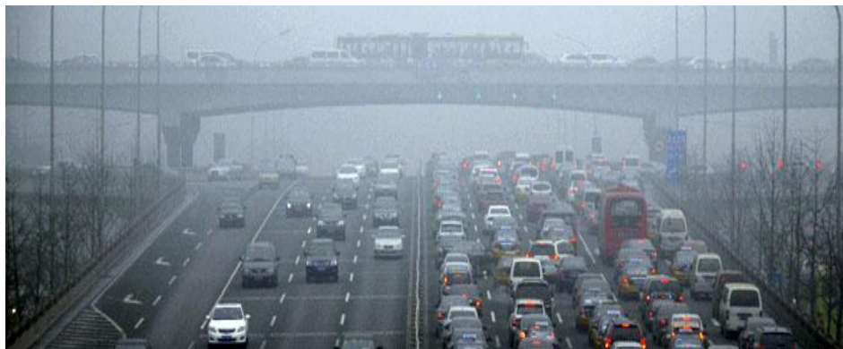
Fig. 2. Burning fossil fuels through Transport Sector

Yes, Burning fossil fuels and deforestation are its chief culprits. Burning of fossil fuels in transport as shown in Fig. 2 , industrialization & power plants etc. and cutting of forests, known as deforestation are major contribution.