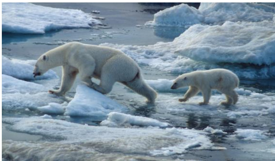
Fig. 3. Threatening for polar bears that depend on the ice for habitat

Researchers predict that nearly ice-free summers are on the way, although it's not yet clear when this will happen. This shift has implications for climate in particular, it is expected to aggravate global warming and for the animals, such as polar bears and walrus, which depend on the ice for habitat as shown in Fig. 3 . But the loss of ice over the Arctic Ocean also opens up the possibility for increased shipping, tourism, oil and gas exploration, and fishing. But this potential development raises challenges with which nations will have to grapple, said Anne Siders, a postdoctoral researcher with the Columbia Center for Climate Change Law, to an audience at Columbia University Wednesday, Sept. 19, 2012. Siders was among a panel of researchers who discussed the science behind the declining sea ice, the suite of changes occurring in the Arctic and public perception of it. A predictably open Arctic Ocean creates opportunities and challenges for nations that ring the Arctic region.