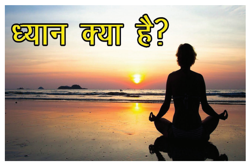
Figure 5.2: Meditation - The Way to Get Rid of Actions and Thoughts

Many saints, gurus or mahatmas suggest various revolutionary methods of meditation, but they do not tell that there is a difference between method and meditation. There is a difference between action and meditation. Action is a means, not an end. Action is a tool. Action is like a broom (cleaning tool).