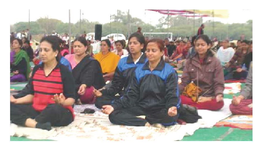
Figure 6.3: Involvement of adults, children and adults in meditation

For this, if we fix the time, place and object of meditation, then meditation is done better. Don't let other thoughts come to your mind while meditating. Thoughts will come again and again, but through effort these thoughts can be removed and meditation can be done. By doing regular meditation, you can easily see the results in your everyday life by increasing the sharpness of the intellect, increasing the memory power, increasing self-confidence, not losing the balance of mind in adversity.