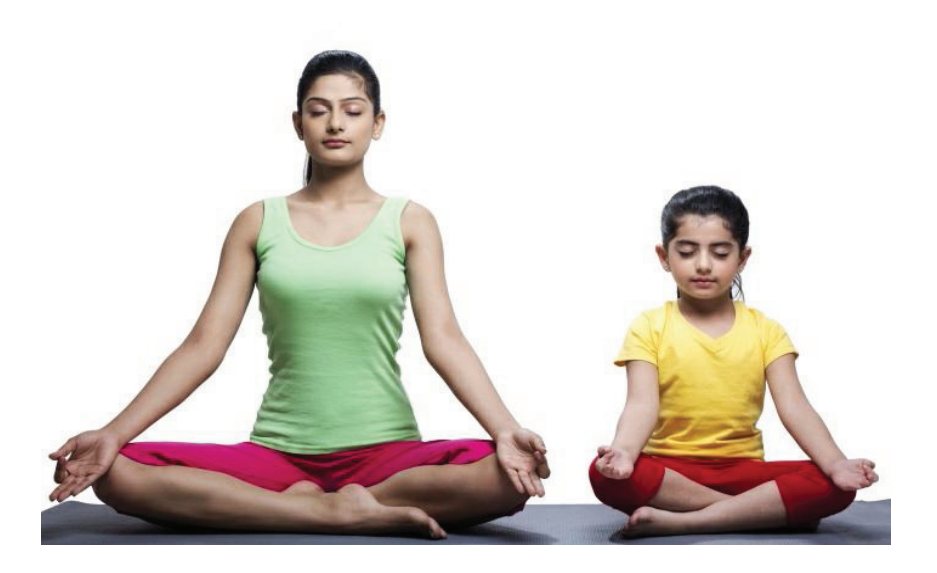
Figure 5.1: Ten Minutes Meditation With Eyes Closed