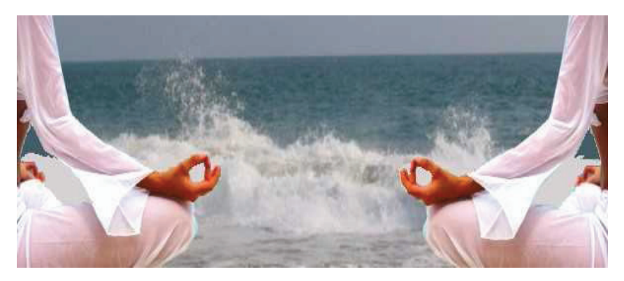
Figure 6.6: Vipassana - People Feeling The Breath Through The Nostrils

6.6.3 Vipassana is not a method, it is nature: There is no need for any kind of frills or living in solitude for doing Vipassana. Its good practice can be done only by staying in the crowd and noisy. While riding a bike, sitting in a bus, traveling in a train, traveling in a car, on the side of the road, in the shop, in the office, in the market, at home and while lying on the bed, keep doing this method anywhere and nobody knows. It will not work that you are meditating.