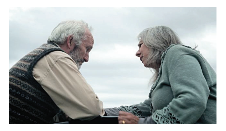
Figure-1: Mental patients with stress

Some times you experience that if something is infront of you it develops irritation / tension in the mind or anger. Try to keep yourself away from such things as too much stress can lead to depression. The depression always weakens your memory power and you cannot concentrate on anything. To avoid this, it will be necessary to consult a doctor ( Fig. 1 ).