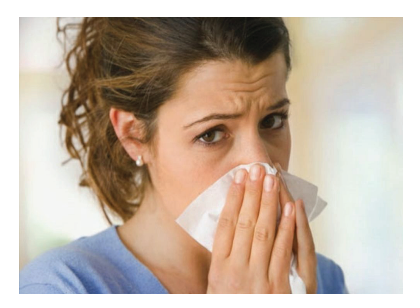
Figure 7.1: Suffering from cold and fever

7.2.1 Meditation to Prevent Colds and Fever : According to a study from the University of Wisconsin-Madison, adults who meditated or did light exercise like walking were less likely to suffer from colds for eight weeks than those who did not. The ones who didn't do anything like that. Earlier studies also found that meditation improves mood and reduces stress, as well as improves immunity.