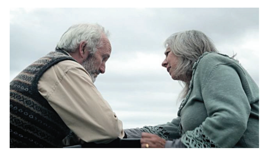
Figure-1: Mental patients with stress

Some times you experirnce that if something is infront of you it develops irritation / tension in the mind or anger. Try to keep yourself away from such things as too much stress can lead to depression. The depression always weakens your memory power and you cannot concentrate on anything. To avoid this, it will be necessary to consult a doctor ( Fig. 1 ).