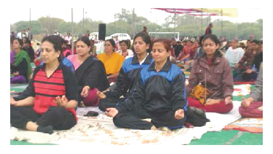
Figure 6.3: Involvement of adults, children and adults in meditation

For this, if we fix the time, place and object of meditation, then meditation is done better. Don't let other thoughts come to your mind while meditating. Thoughts will come again and again, but through effort these thoughts can be removed and meditation can be done. By doing regular meditation, you can easily see the results in your everyday life by increasing the sharpness of the intellect, increasing the memory power, increasing selfconfidence, not losing the balance of mind in adversity.