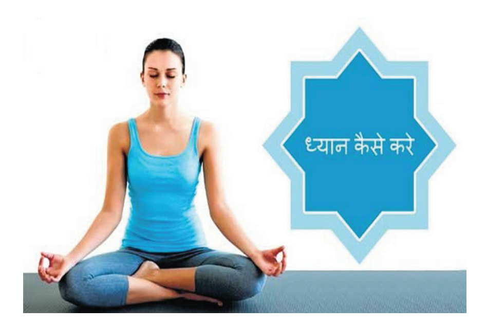
Figure 6.1: How to Meditate

6.1.1 Importance of Breathing Movement: In yoga, the movement of breath has been recognized as an essential element. This is how we are connected to the inner and outer worlds. The speed of breathing changes in three ways -1). Attitude, 2). Atmosphere, 3). Body movement. In this, the speed of breathing is more driven by the mind and brain. Just as there is a huge difference in its speed between anger and happiness.