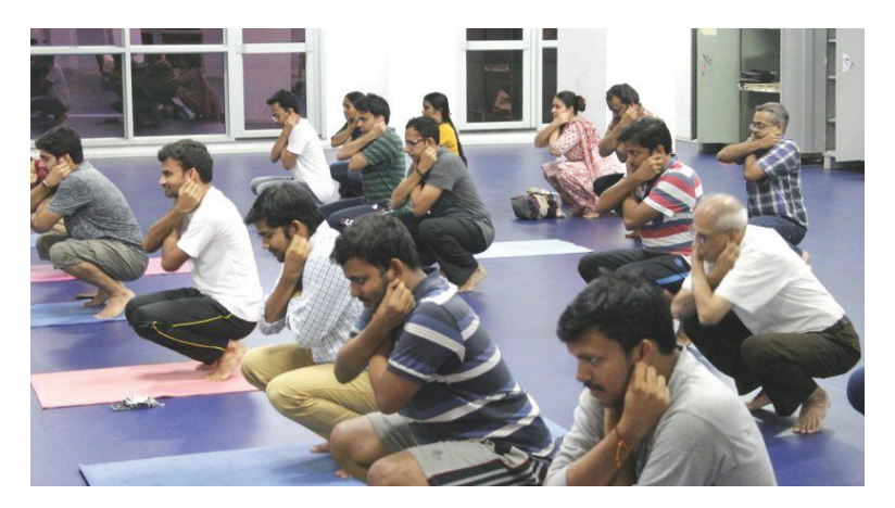
Figure 4.4: Superbrain Yoga Practice by Indian Common People