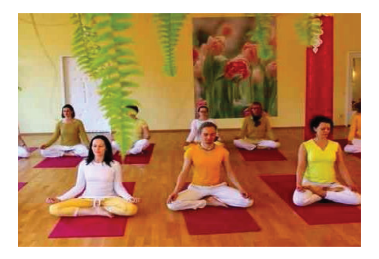
Fig. 5.3: Yogis Meditating While Sitting In Siddhasana