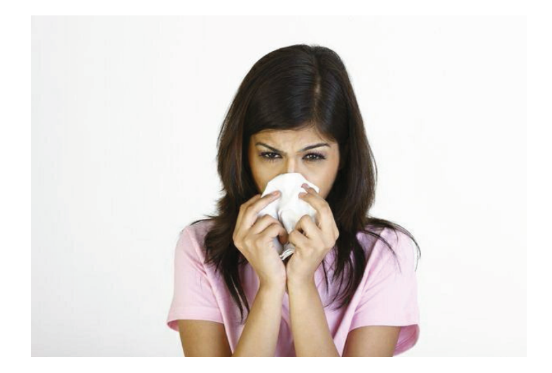
Figure 7.2: Suffering from cold and fever

phlegm will also end. In the beginning you do 50-times. After that gradually increase it 10 to 15 times daily. If you want, you can increase its number to one thousand.