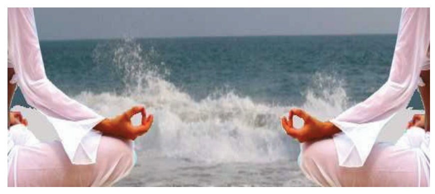
Figure 6.6: Vipassana - People Feeling The Breath Through The Nostrils

6.6.3 Vipassana is not a method, it is nature: There is no need for any kind of frills or living in solitude for doing Vipassana. Its good practice can be done only by staying in the crowd and noisy. While riding a bike, sitting in a bus, traveling in a train, traveling in a car, on the side of the road, in the shop, in the office, in the market, at home and while lying on the bed, keep doing this method anywhere and nobody knows. It will not work that you are meditating.