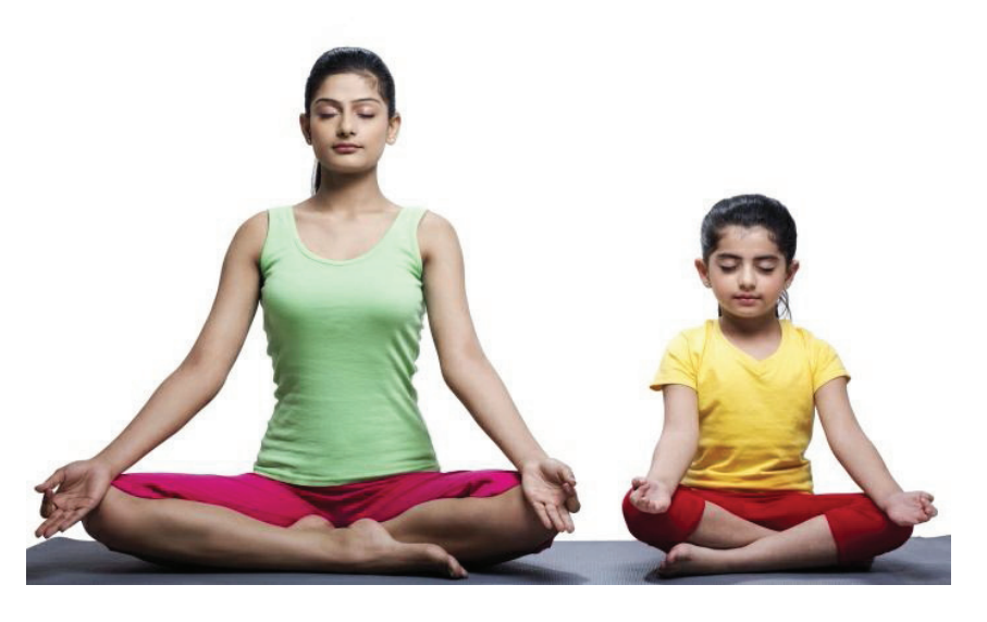
Figure 5.1: Ten Minutes Meditation With Eyes Closed