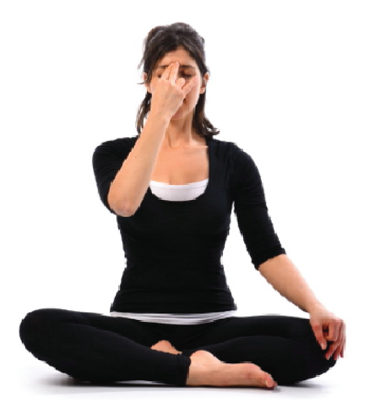
Figure 6.4: Nasal Vision Pose

This awakens the Muladhara chakra because the Ida, Pingala and Sushumna nadi, which are located between the two eyes, have gone to the Muladhara.